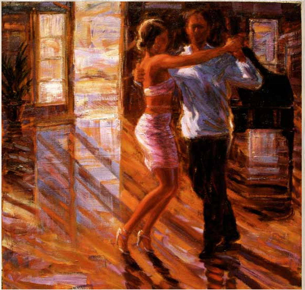
Thursday Night Salsa!

No partner required. Lessons available. Please ask your server for details.